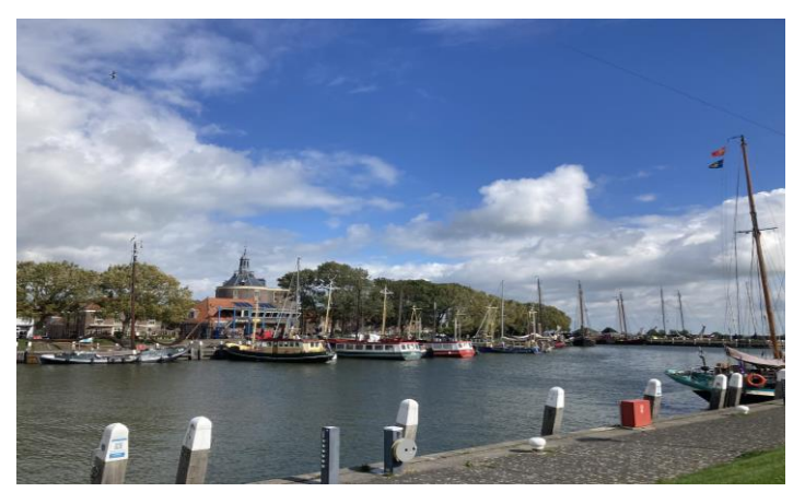
Enkhuizen's Drommedaris tower