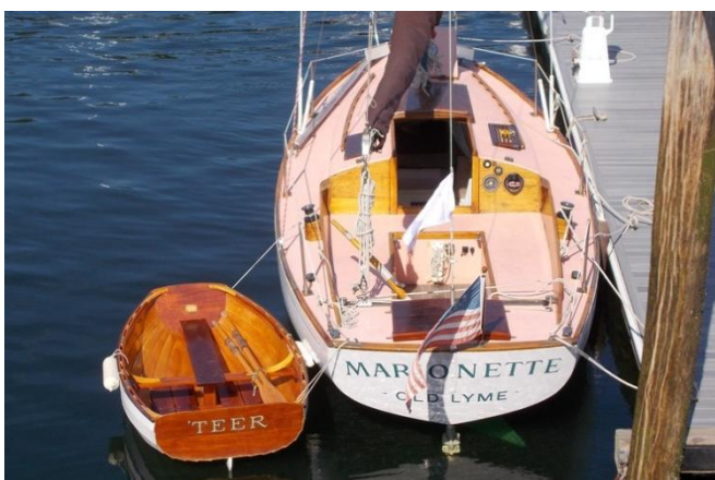
Marionette and 'Teer' together